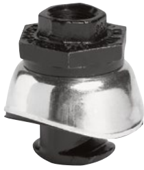
NPT & BSPT Models